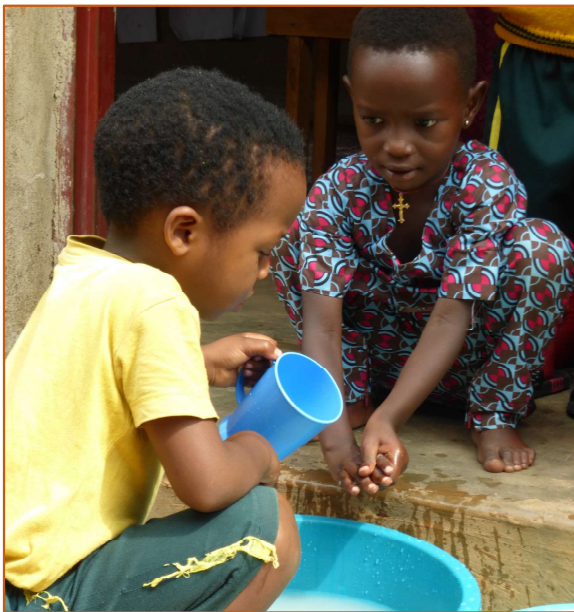
Children in our schools collaborate—and so does TEACH Rwanda!

Our advocacy—primarily through partnerships and the influence of RENCP with its working groups (co-chair of Teacher Education Working Group, member of Early Childhood Education Working Group)—is even more influential now that Bright School has convincingly showcased how children who attend high-quality preschools can succeed far beyond traditional expectations when their engaging learning experiences continue into their primary years.