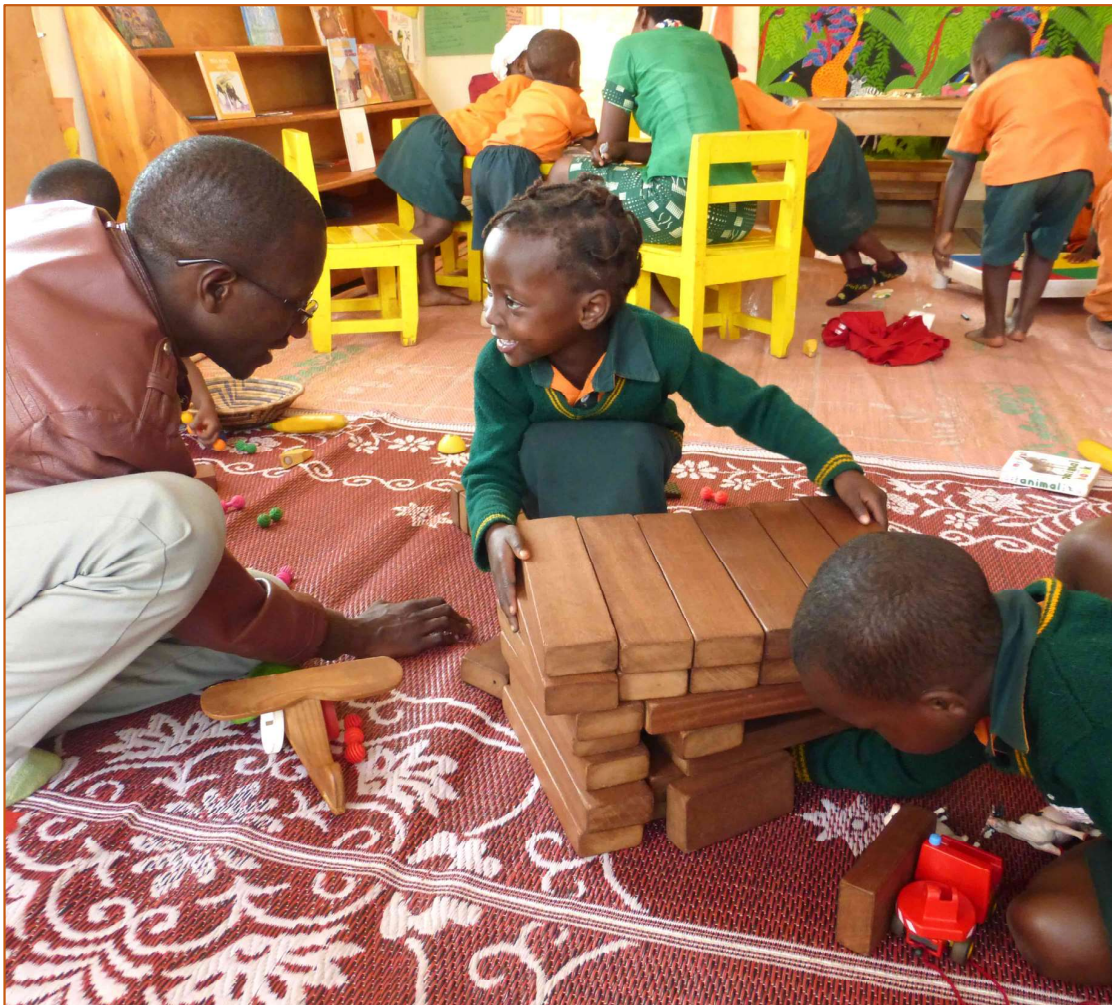
Classrooms in TEACH Rwanda accredited schools are bursting with energy and love!